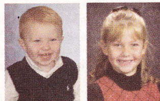
Future Owners (WITH YOUR SUPPORT) Thanks!

COMMENTS ALWAYS WELCOME ART EXPO'S OFFICE 913-685-9955