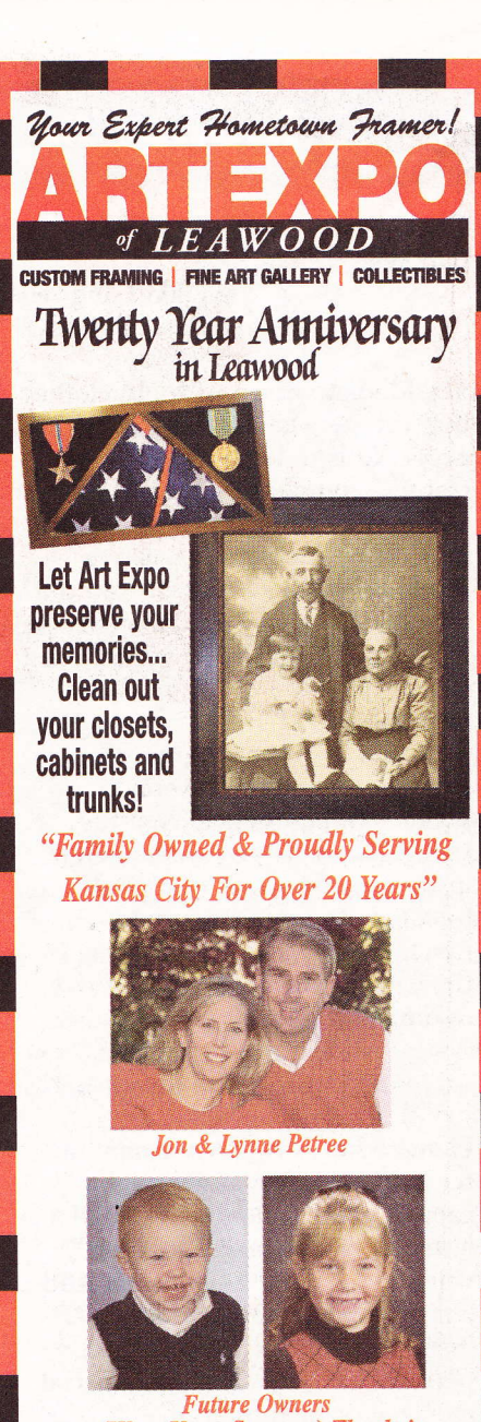
(WITH YOUR SUPPORT) Thanks!

COMMENTS ALWAYS WELCOME ART EXPO'S OFFICE 913-685-9955